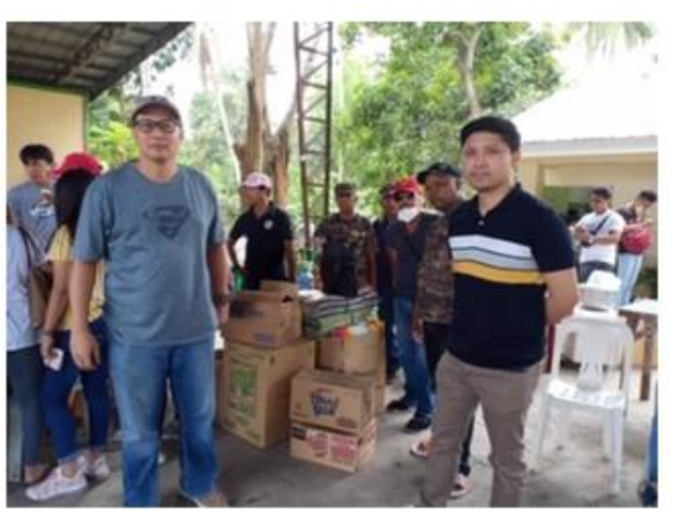
Outreach Activity conducted by the officers of BDOLF Batangas (Taal Volcano Eruption)

As member of the BDO Group, BDOLF pursues its corporate citizenship initiatives through BDO Foundation, BDO's corporate social responsibility arm. Backed by the BDO community, the Foundation develops and implements programs designed to address the needs of the underprivileged and underserved members of the society. Its advocacies fall under two pillars: disaster response, which includes relief, rehabilitation, and reconstruction programs; and financial inclusion.